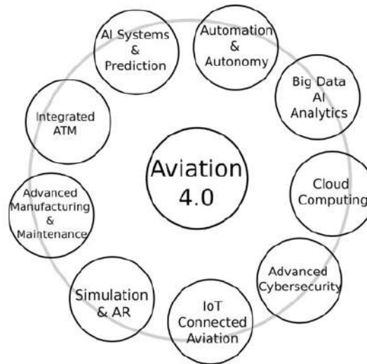
Fig. 2. Technological aspects addressed by Industry 4.0 in aviation.

Information collected on an aircraft is stored and used in air accident cases to generate reports and obtain evidence. The analysis of data and knowledge of the flights are already carried out efficiently with artificial intelligence applications, which are capable of performing very complex studies that involve all the electronic data of the entire aircraft allowing to provide a better result in the determination of evidence in accidents or causes of accidents[3].